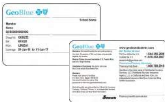
ID card images for illustration purposes only