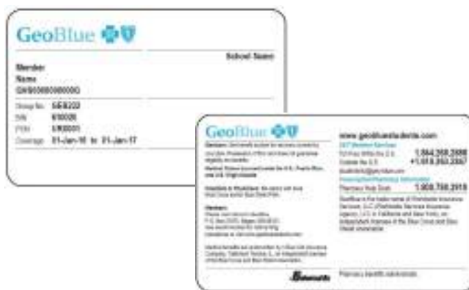
ID card images for illustration purposes only