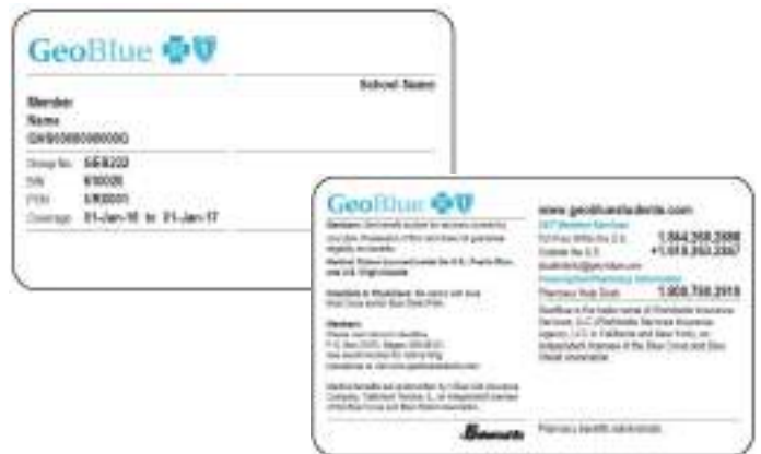
ID card images for illustration purposes only