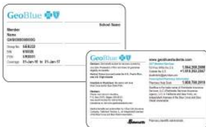
ID card images for illustration purposes only